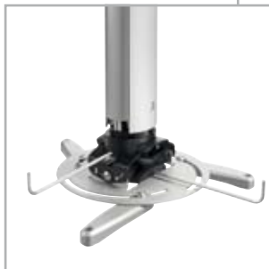
Fine tune tilt and roll adjustment Tilt and roll +/- 15°