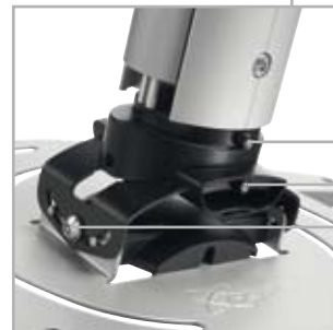
Fixation in all directions