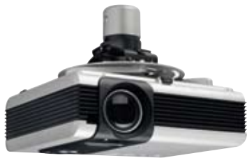
Mounted directly to the ceiling

These mounts can be installed directly to the ceiling or they can be used with a Connect-it Basic pole and ceiling plate in case of higher ceilings.