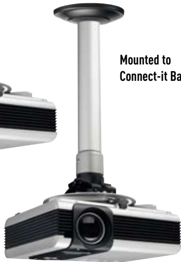
Mounted to Connect-it Basic pole